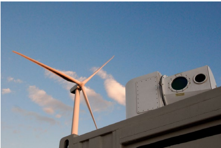
WindTracer® is the Doppler lidar of choice for characterizing wind resources over large areas.